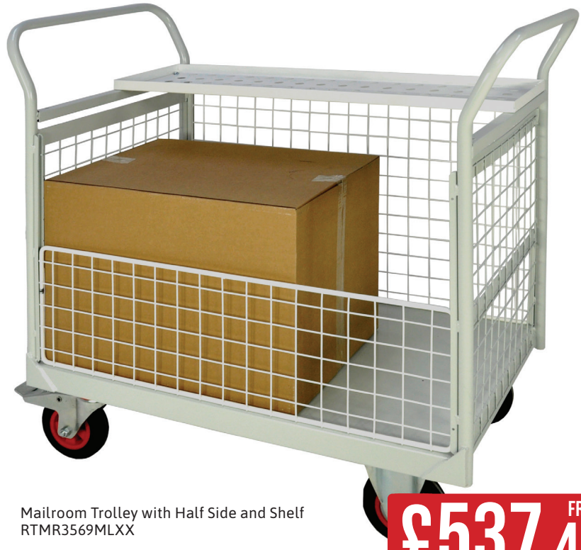
Mailroom Trolley with Half Side and Shelf RTMR3569MLXX